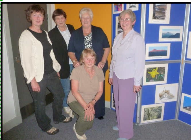
Members of the Hall Camera Club at the open evening, which was held in the summer, beside a collection of photographs taken during the digital camera courses. The camera club meet monthly on a Wednesday - please contact 702669 for details and dates.